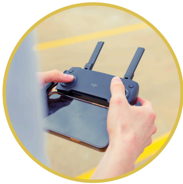
AERIAL DRONE SERVICES