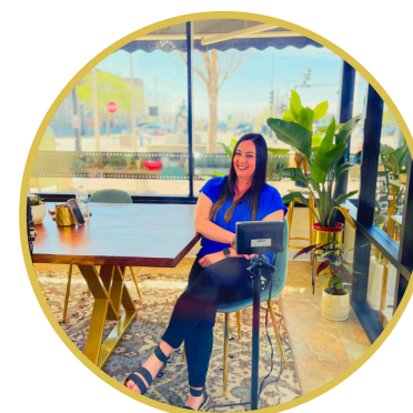
SOCIAL MEDIA SERVICES